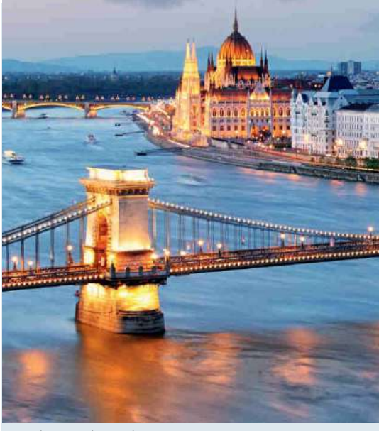
Budapest: the Parliament